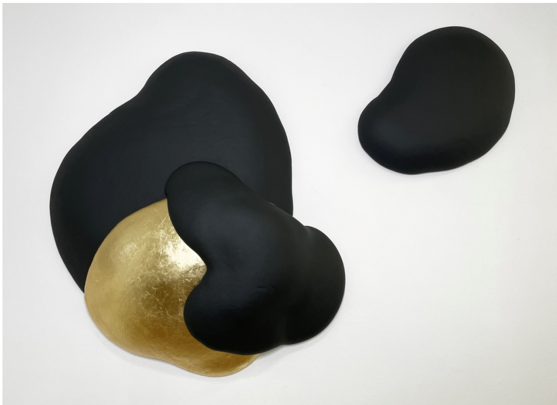
Valery Guo September 22, 2022 Mixed media Cm 170 x 130 x 30

When it matures, the 怪 is mummified according to ancient Egyptian rituals, forever wrapped in layers of colored concrete. At the end of the process, the 怪 is ready to regain its eternal life somewhere in the outside world.