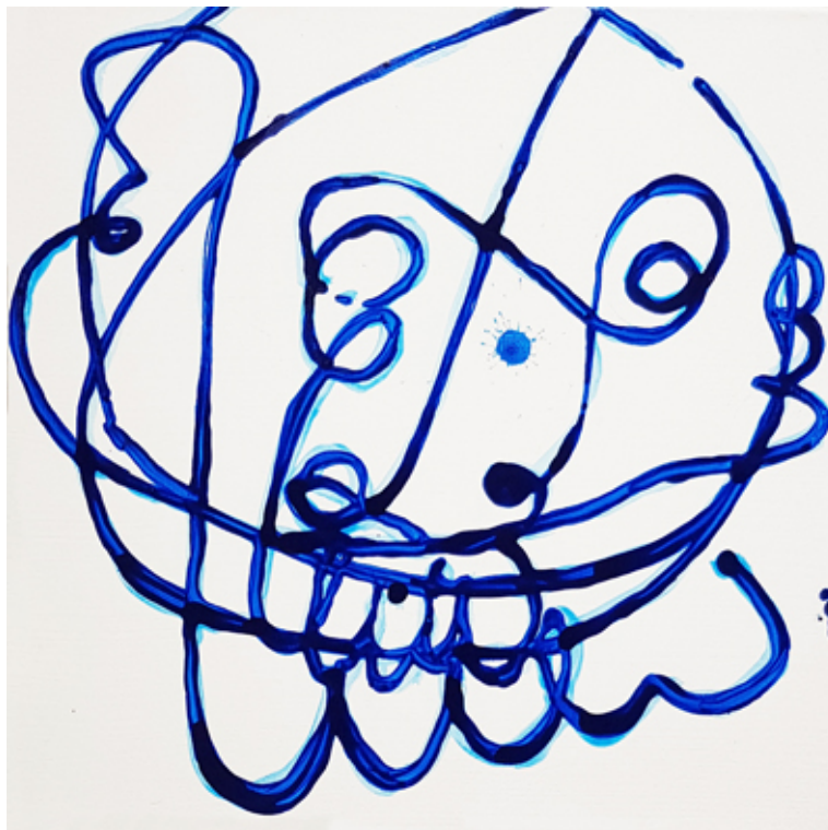
Danilo Bucchi BLU38, 2021 Enamel on canvas – cm 30 x 30

In 2018 he entered the permanent collection of the National Gallery of Modern and Contemporary Art in Rome with the work "LIQUID" and in 2020 he created the monumental work of the port of Giardini Naxos in Sicily.