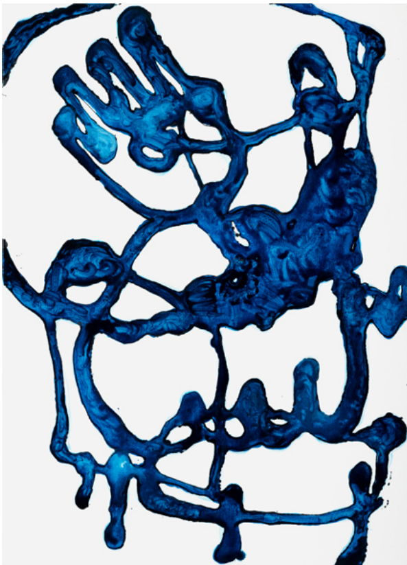
Danilo Bucchi BLU23 , 2021 Enamel on canvas – cm 70 x 50

After having faced the long breathing of the black mark on white backdrops, after having inserted arterial fringes of red between the textures of the black marks, after having plunged his gaze into total black, Danilo Bucchi thus rediscovers with Blu the geography of white on which the flow rivers of his new chromatic twin: a mineral and boreal blue, slippery between loops that widen and tighten, between rivulets that splash and compact the chromatic density, between elastic curves that make us think of the Planet seen from the sky but also of the microcosm that naked eye does not perceive.