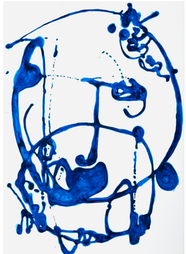
Danilo Bucchi BLU22 , 2021 Enamel on canvas - cm 70 x 50