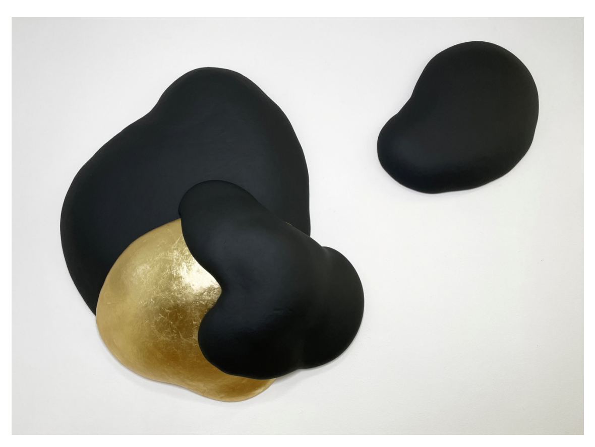
Valery Guo September22, 2022 Mixed media Cm 170 x130 x 30

When it matures, the 怪 is mummified according to ancient Egyptian rituals, forever wrapped in layers of colored concrete. At the end of the process, the 怪 is ready to regain its eternal life somewhere in the outside world.