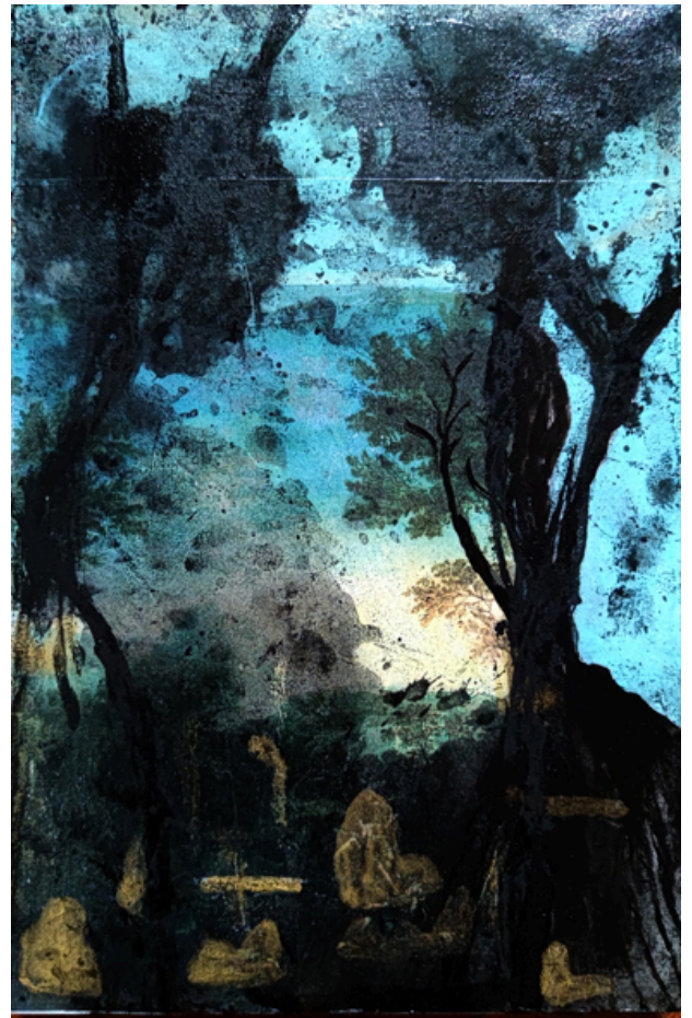
Arcangelo Paesaggio 2022 Mixed media on canvas - cm 30 x 20