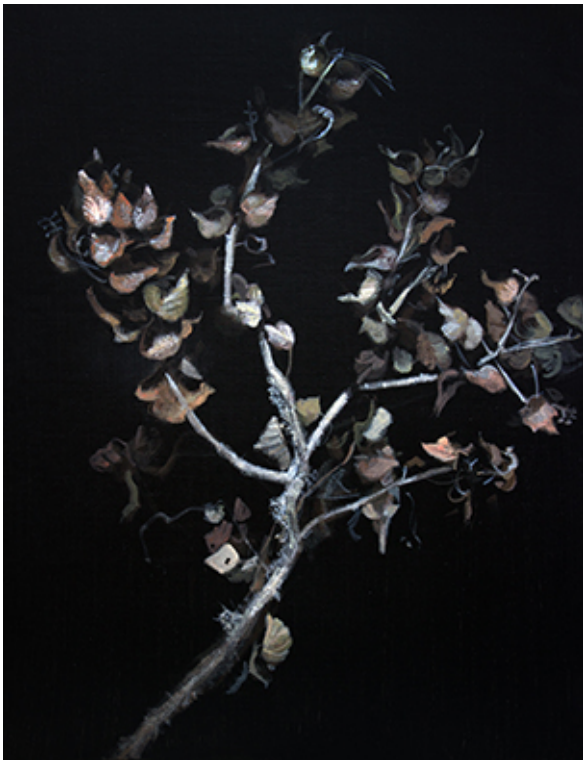
Adrien Eyraud Feuille, 2021 Acrylic on canvas - cm 65 x 50