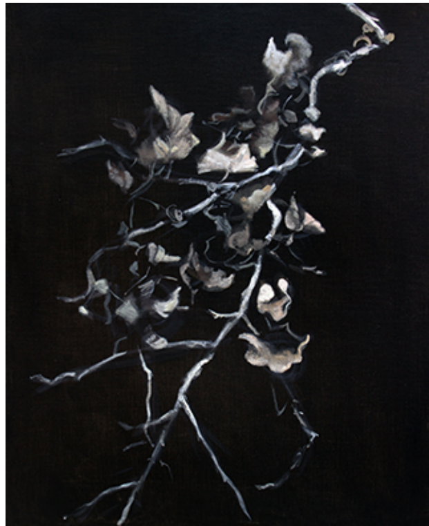
Adrien Eyraud Feuille, 2021 Acrylic on canvas – cm 65 x 50

The artist wishes to present these portraits as living testimonies of our society. Black backgrounds are not just an aesthetic choice, but a deliberate decision to express the emptiness, fears and unknowns that often accompany the aging process. Black, as a backdrop, symbolizes the dark, unexplored areas of our thoughts, our apprehensions about the inevitable passage of time.